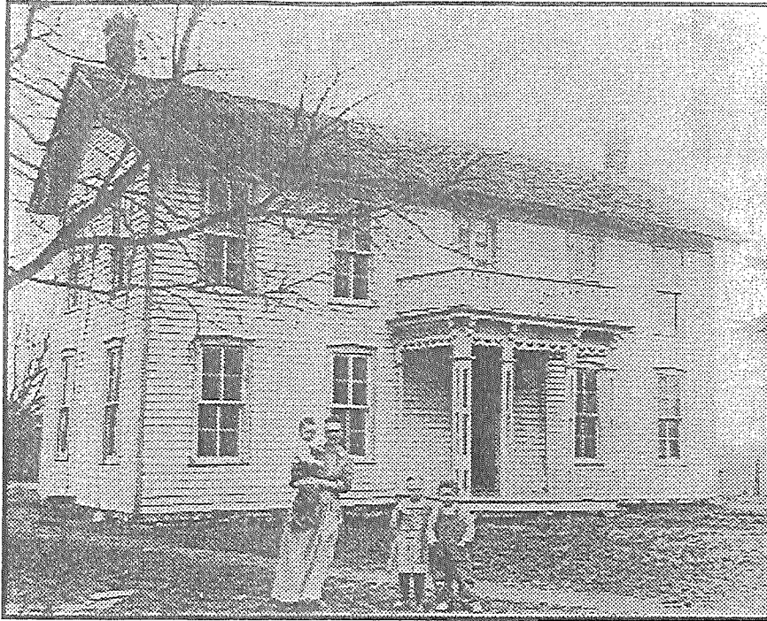
Family Home about 1912