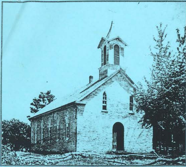
Old Rock Church-1865