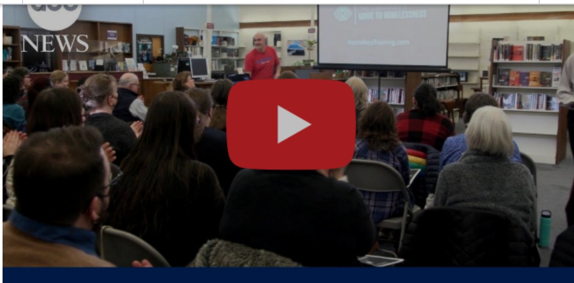
Have you thought about your library in this way?